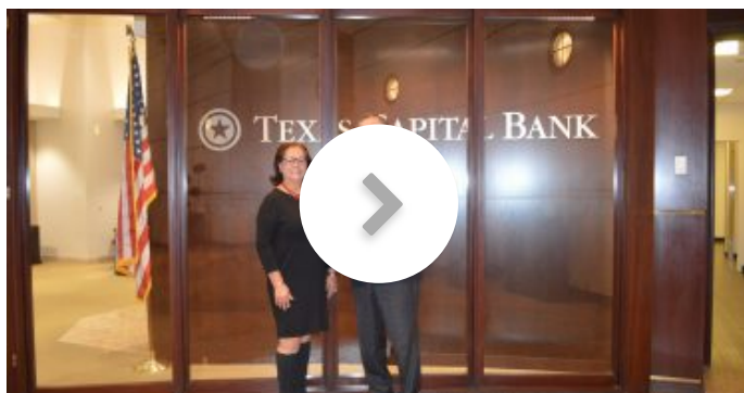
Dallas-based Texas Capital Bank joins with BCL of Texas to support community investment